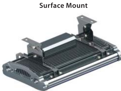
Adjustable Mounting Brackets (Standard)