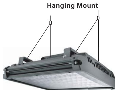
Supplied with Gripple Hangers (GPPL)